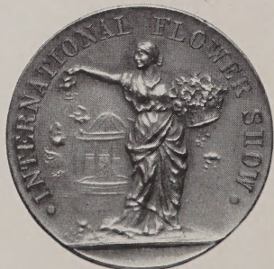
For Display Narcissus March 19-24, 1934 (204 varieties)